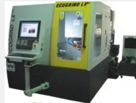
5Axis cnc machine