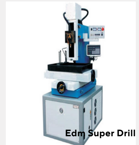
Edm Super Drill