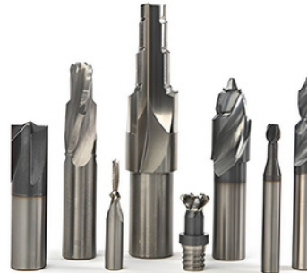
Your paragraph text Form tools