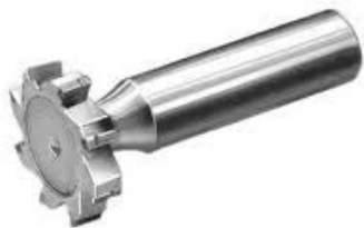
Brazed Type cutters